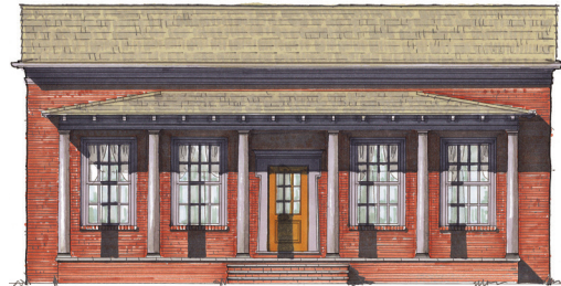
Alternate Elevation 1