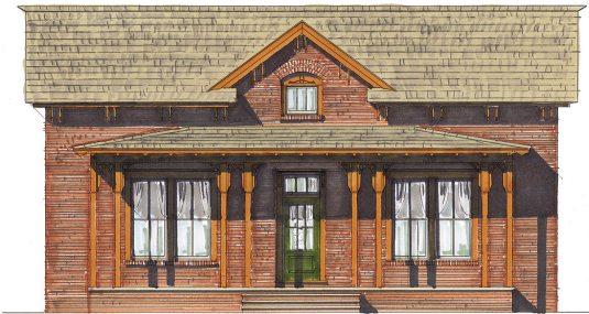
Alternate Elevation 2